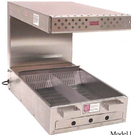
Model RR5C Shown

Marshall's custom built Fried Foods Dump Station incorporates ThermoGlo™ technology and can be used for holding and warming a variety of other food products.