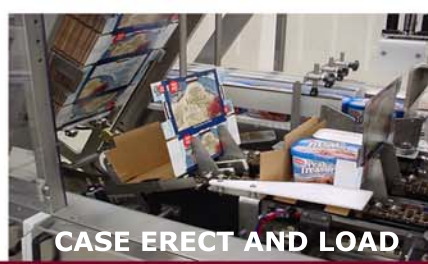
CASE ERECT AND LOAD