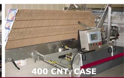
400 CNT. CASE