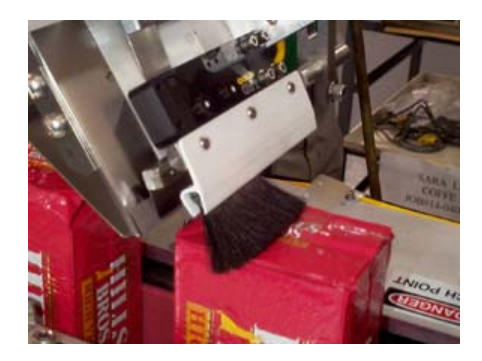
Available with Wipe-on with brush or with a Tamp Applicator (Model 010 Wipe-on with brush featured above)