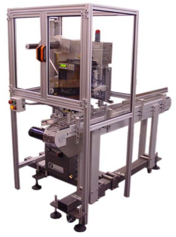
Model 1300T Print & Apply with optional enclosure

Fax: (201) 405-1179 www.labelingsystems.com Email: LSI@LabelingSystems.com