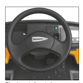
Clear layout of controls ensures easy operation.