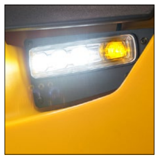
Reliable LED lighting (optional)