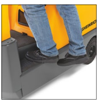
Ergonomic low step for effortless entry and exit.