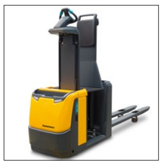
Lifting stand-on platform (HP-LJ) for 2nd level order picking (optional)