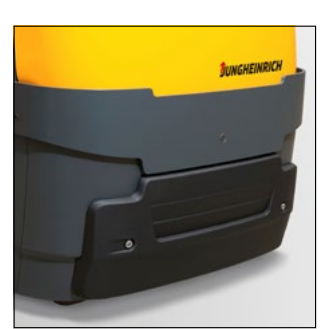
Solid rubber or steel bumper