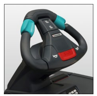
JetPilot – exclusive from Jungheinrich