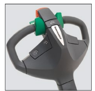
Flexible universal stacker