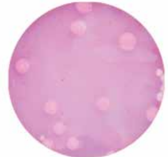
DBRC agar spread plate at 5 days incubation