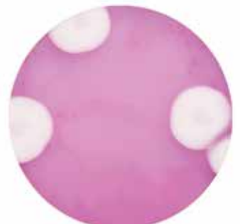
DBRC agar spread plate at 5 days incubation