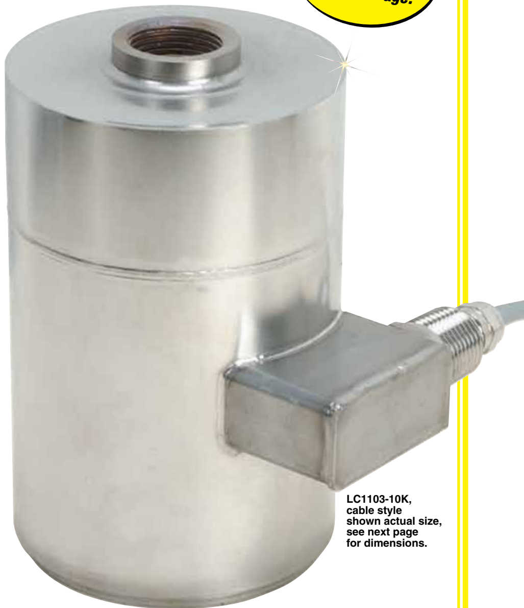
LC1103-10K, cable style shown actual size, see next page for dimensions.