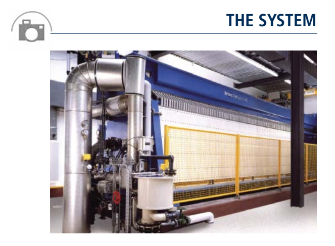
Plate size: 470/630/800/1000/1200/1500 mm, Cake thickness: 25/32/40 mm