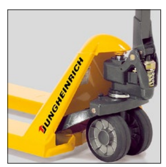
Permanently lubricated joints for maintenance-free operation