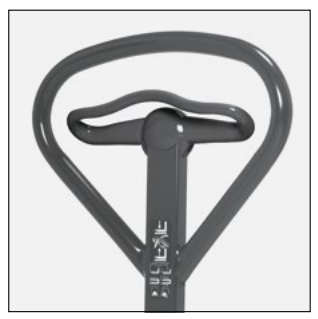
Ergonomic operating handle