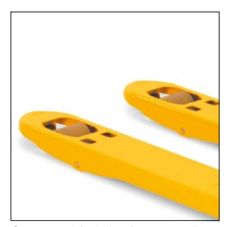
Contoured fork tips for easy pallet