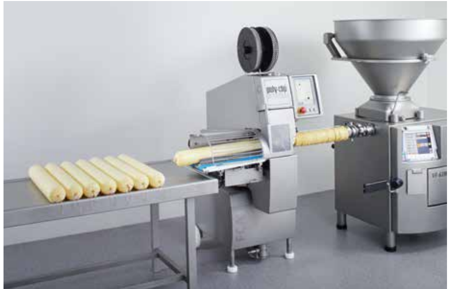
FCA 160 – powerful machine for large calibres