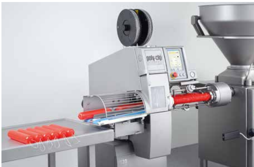
FCA 120 – the specialist machine for high speed production of calibres up to 120 mm