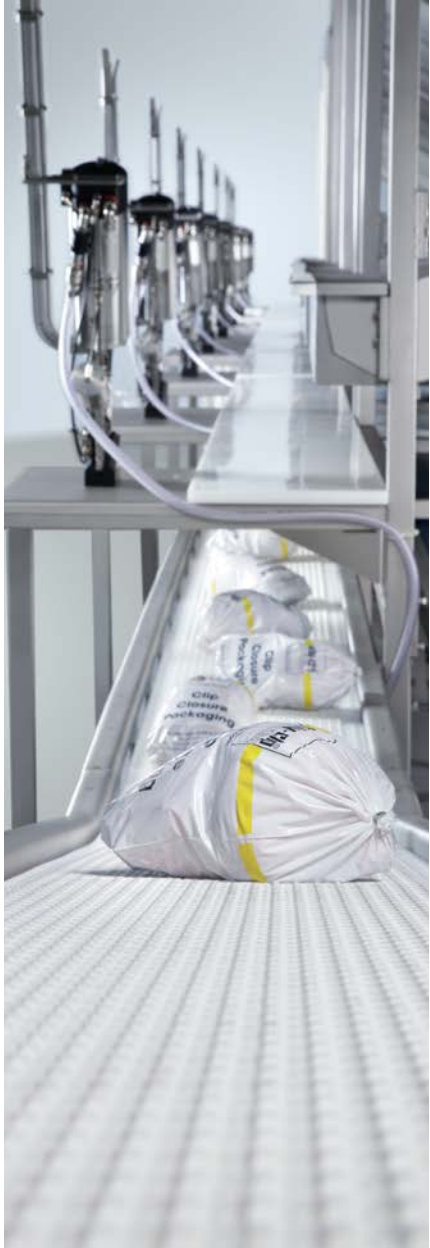
Individual integration into the packaging line

For the success of a meat processing enterprise first-class hygiene is of critical importance. The careful selection of belt materials and components increases the efficiency of plant hygiene measures and reduces contamination risks to a minimum. And the optimal adaptation of belt modules to the line as a whole, and the correct selection of belt surfaces, help to ensure seamless transition between modules. The quality of sensitive foodstuffs is thus retained.