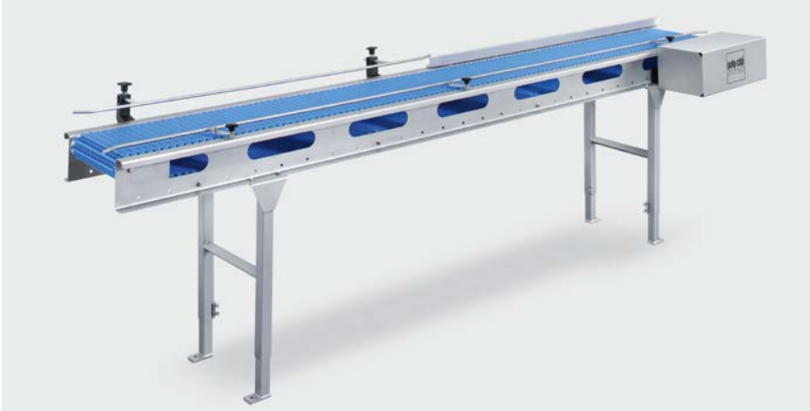
Example of a belt section with motor housing