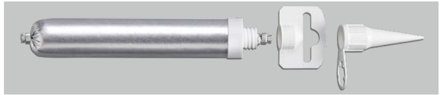
One possible combination of attachments applied by the CBS: re-sealable clip-tube® with threaded end piece, screw cap with Euro hanger and extrusion nozzle