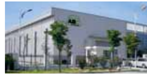
ABC CHINA WUJIANG