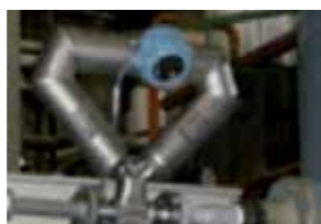
Real measuring of flow and consumption