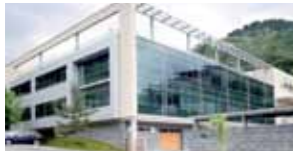
ABC HEADQUARTERS SPAIN EIBAR