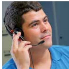
Helpdesk 24 h

With sales and service offices strategically located worldwide, ABC guarantees the best aftersales service.