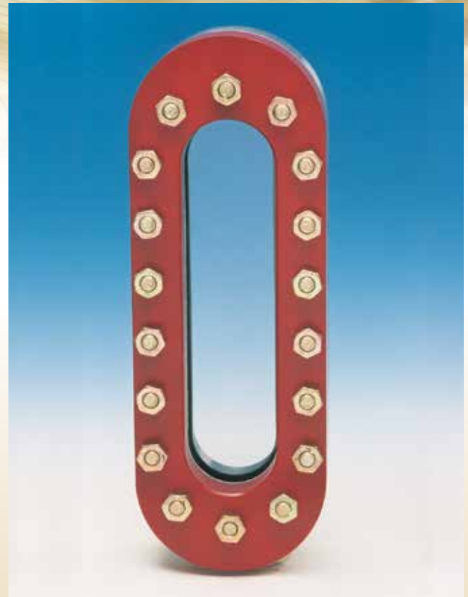
Obround Weld Pad Gages